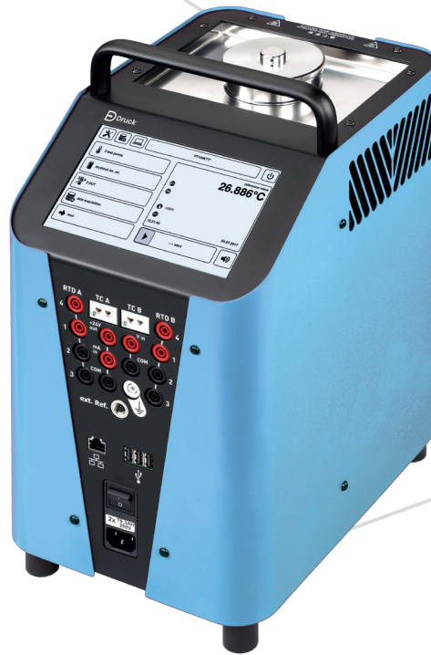
PTC165i Integrated measuring instrument