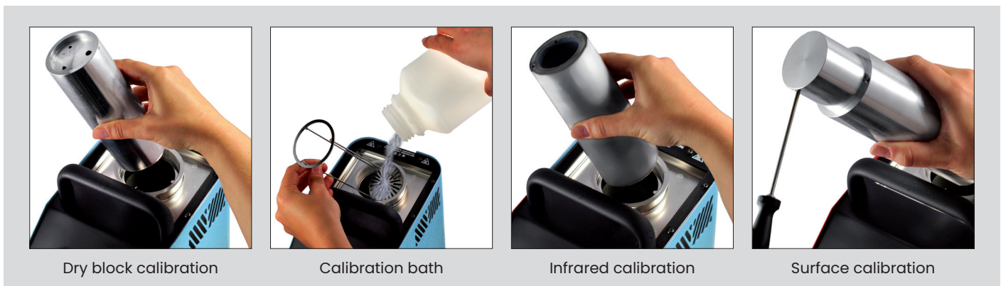
Dry block calibration

Every Druck temperature calibrator is meticulously tested for accuracy and stability. This is attested by our standard calibration certificate, which we issue with every temperature calibrator, or by means of an optional ISO 17025 calibration certificate. This is to guarantee that you receive a perfect product which can be traced back to national and international temperature measurement standards.